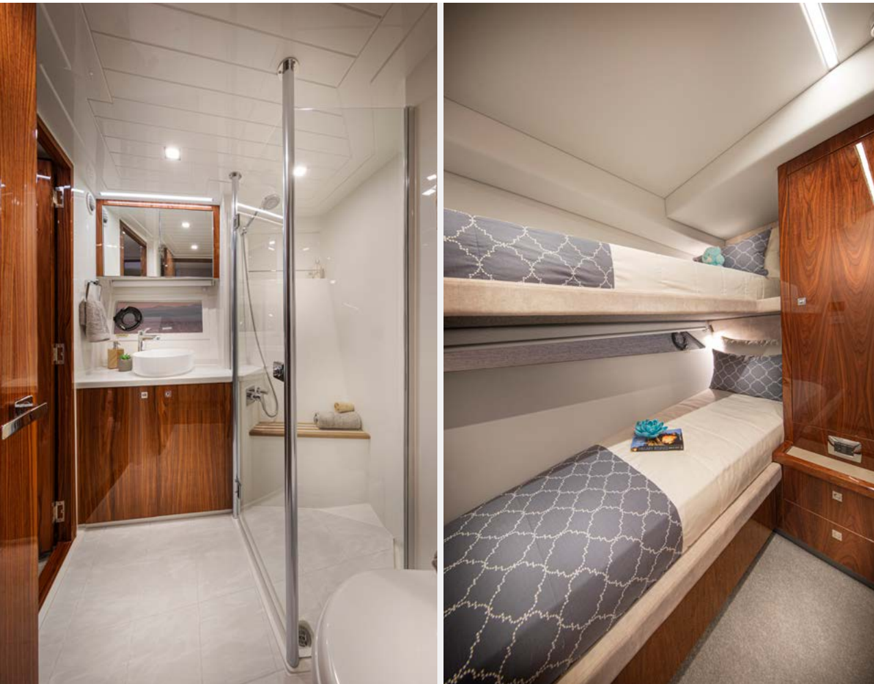
LEFT - Port guest stateroom offers versatility as twin single berths slide together at the touch of a button to create a double.

When the finest materials meet superior flair, true luxury is created. That's exactly what you and your guests will experience on the accommodation deck of this unique yacht.