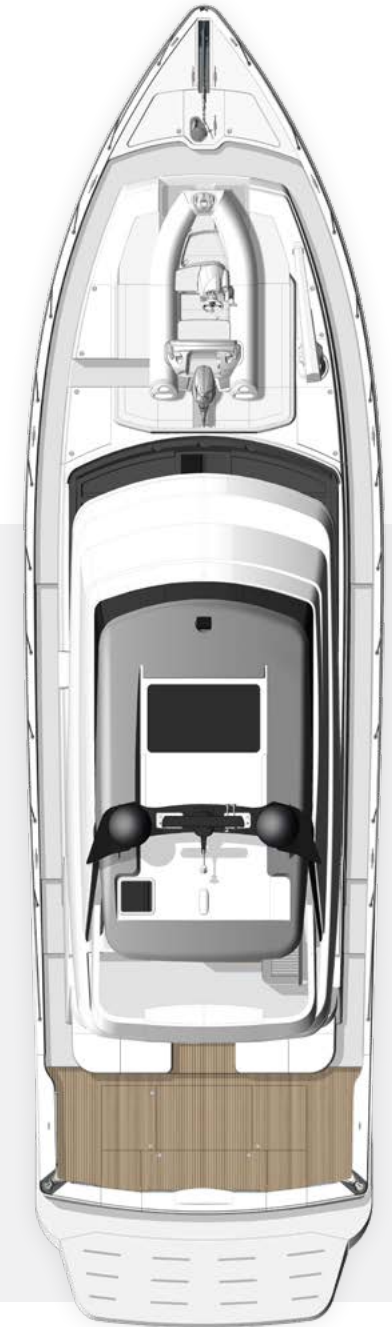
HARDTOP Shown with optional teak floor

Due to the constant refinement of specifications and design by Riviera Australia, the information in this document may change without notice. Specifications may vary with time and by region. Some images or illustrations in this brochure may include options or custom details. Please note that as safety equipment specifications or standards vary by country, this aspect of your purchase will need to be completed by you and/or your Riviera representative. Please refer to your Riviera representative for specific warranty cover and the latest detailed list of inclusions and options prior to purchase.